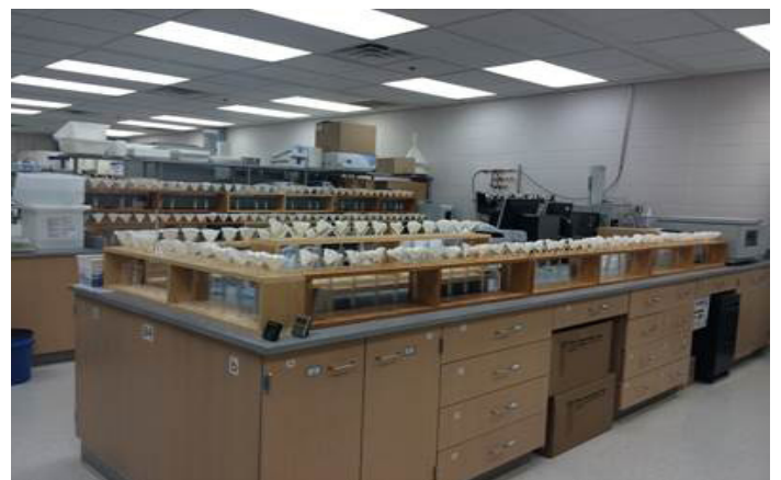
USDA-ARS soil microbiology laboratory in Lubbock, TX Supervised by Verónica Acosta-Martínez

In limited irrigation and dryland systems, agricultural conservation practices that keep the soil covered and fed with plant residues are expected to improve SOM and the soil microbiome’s adaptation to climate variability, which may include prolonged drought, and to increase water use efficiency and crop yield (Cano et al, 2017).