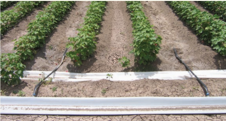
Table 1. Irrigation systems and methods used in Texas