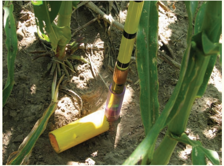
Table 2. Three methods of measuring crop water use

At the start of the season, producers should plan a strategy that encompasses decisions about when and where to irrigate and how much water to apply. The strategy should be based on a good understanding of crop water use. The advantages and limitations of the three popular methods of measuring crop water use are presented in Table 2.