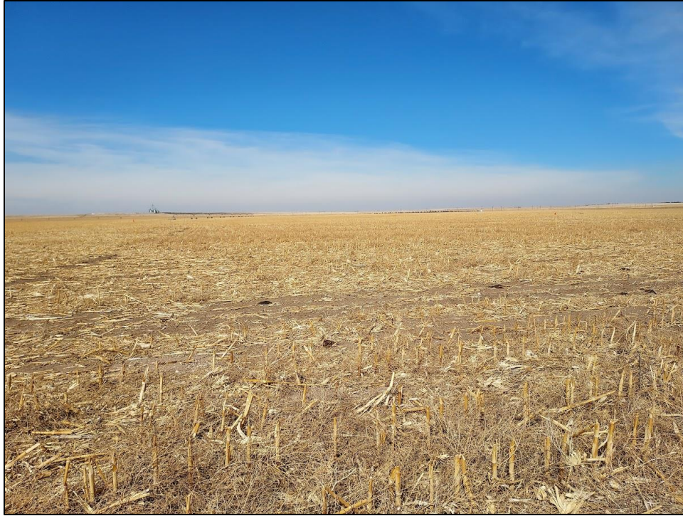
Plate 8. Remaining field residue and manure from beef cattle grazing field study site during the winter off season. March 2023, Dallam County.