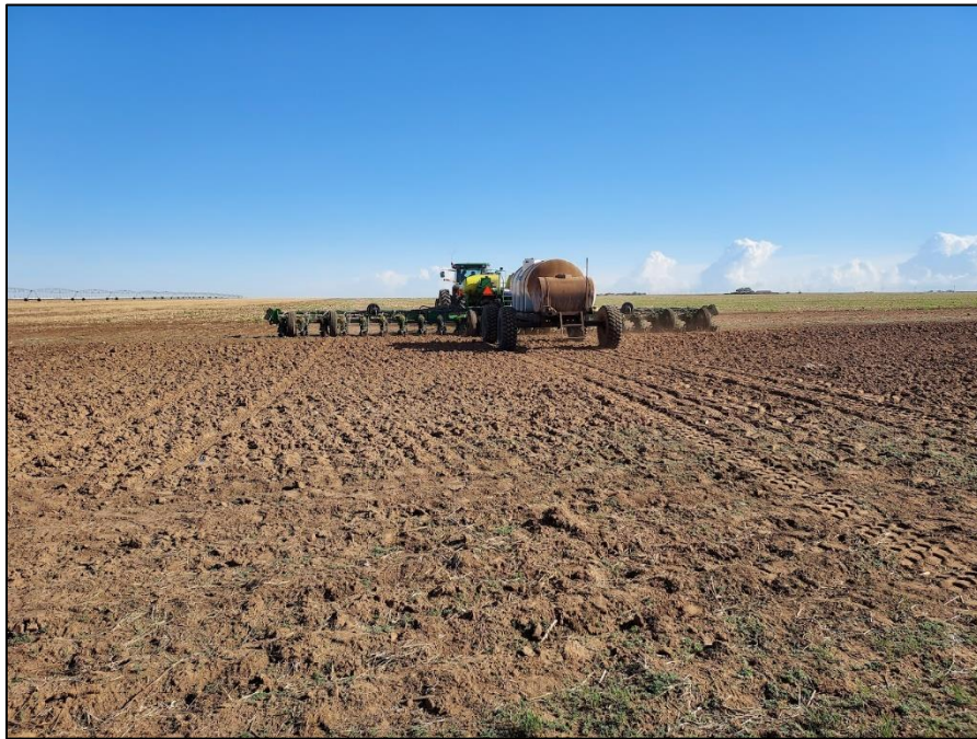
Plate 6. 24-row planter used to establish 8-row plots in RACE trial, Hartley County, May 2023.