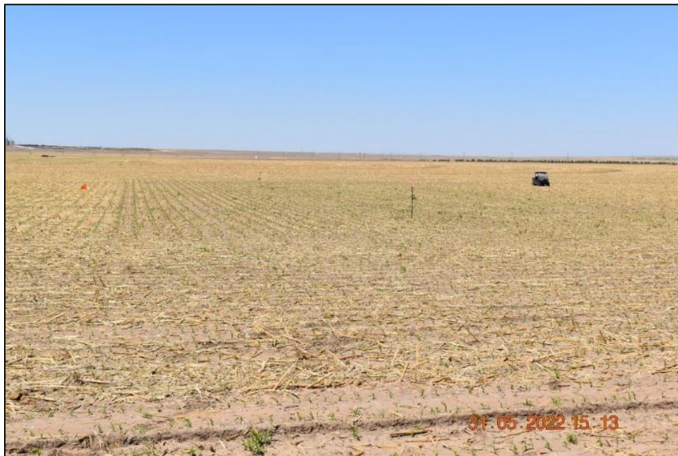
Plate 10. Installed soil moisture sensors within tillage plots of pivot-irrigated field planted to corn in Dallam County, May 2022.