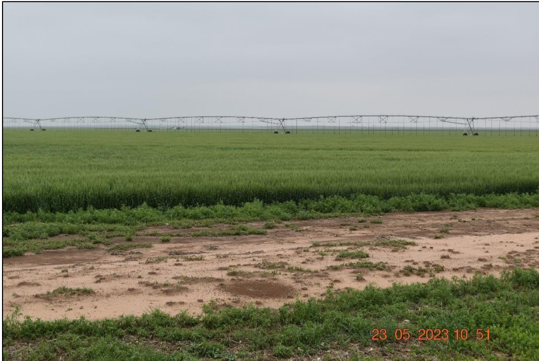
Plate 2. Headed wheat at soft dough stage, May 2023, Moore County.

No doubt everyone in our region appreciated the moisture received. The rain was timely, coming just ahead of or shortly after planting efforts had begun on a new round of warm-season crops. These rainfall events were also a timely bonus for cool-season, small grain crops.