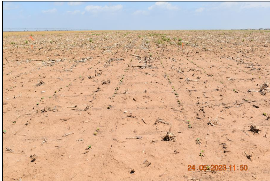
Plate 7. Seedling cotton emergence in RACE trial plots located in Hartley County, May 2023.

The second image below was taken on May 24 th , almost two weeks after planting (plate 7). At that point in time, many cotton seedlings had emerged, and others were still emerging. The situation looked promising in the way of getting an adequate stand. My plan includes collecting mapping notes on one or more varieties at this site starting at pinhead square and continuing through flowering. Collected data will contribute to a database started in 2022 that can be used to refine a target development curve for cotton grown in the northern Texas Panhandle.