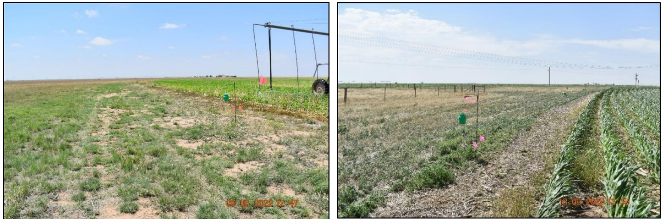
Plates 4 & 5. Adult moth trapping sites for corn at two locations in Sherman County, 2022.

We are fast approaching a new season of adult moth trapping near corn fields (Bt and non-Bt). As soon as the weather permits, traps will be set up and effort will be made to collect weekly moth counts in Moore and Sherman counties. This information helps growers, consultants, and others to keep abreast of moth flights, egg lay potential and likelihood of reaching economic thresholds of worm pressure from four, tracked species. These include the Western Bean Cutworm, Southwestern Corn Borer, Corn Ear Worm, and Fall Army Worm. Plan is to install and monitor 16 bucket traps, four at each of two locations in Moore County and at two locations in Sherman County as was done in 2022 (plates 4 & 5). Collected data is updated to a table format and distributed more immediately to folks via a Remind text. If you're interested in being added to the list of recipients, let me know.