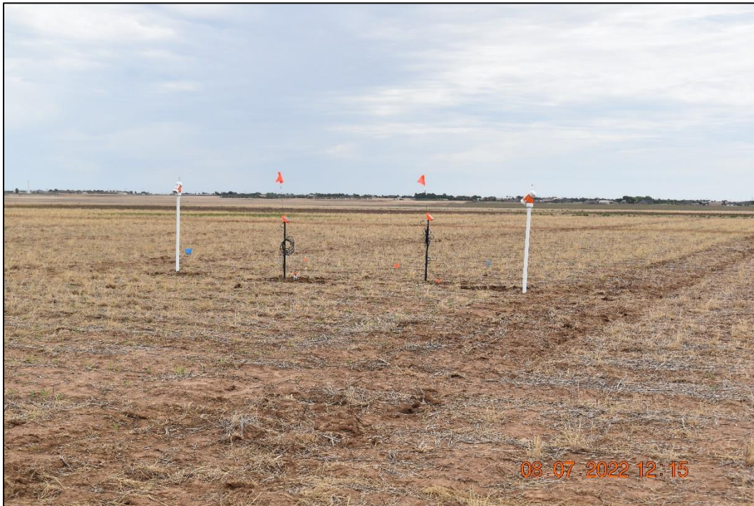
Plate 3. Two brands of installed soil moisture sensors that provide data from multiple soil depths, 2022.

insight on what might be expected about the rate of seedling root growth as well as the ability for young roots to acquire nutrients and water needed for growth above the soil surface.