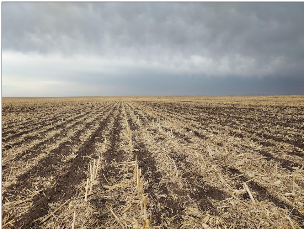
Plate 9. Adjacent strip-till (left side) and conventional-till (right side) treatments in a pivot-irrigated field in Dallam County, May 2023.