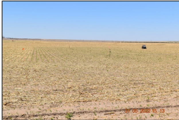
Image 11. Installed soil moisture sensors within tillage plots of pivot-irrigated field planted to corn in Dallam County, 2022.