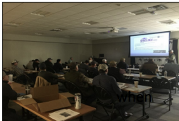
Image 14. Folks attending the Crop Producers Program at Dalhart, 2022.