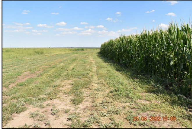
Image 5. Example corn field monitored for late disease in Dallam county, 2022.

Ken Obasa, Ph.D., and I observed 40 fields in Moore and Sherman followed by 30 fields in Dallam and Hartley counties, respectively during mid-September (image 5). These efforts are key to tracking severity and spread of known diseases and to identify the emergence of new diseases. These monitoring efforts provide additional insight and benefits Producer management on the 300,760 acres of corn planted throughout the Northwest Panhandle in 2021. For an estimated benefit of $5 per acre, the total value across all acres would amount to 1.5 million dollars.