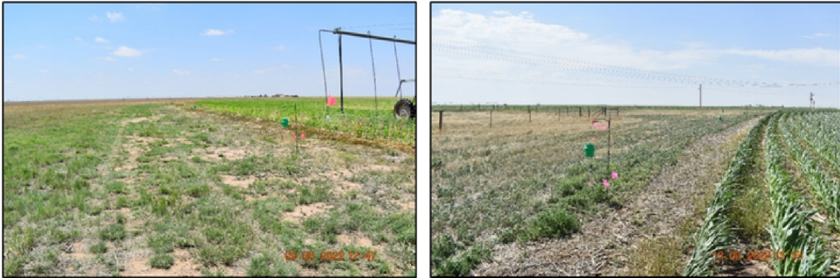
Images 2 & 3. Adult moth trapping sites for corn at two locations in Sherman County, 2022.