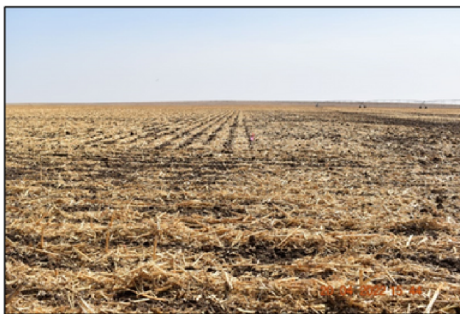
Image 9. Adjacent strip- (left hand) and conventional-till (right hand) treatments in a pivot-irrigated field in Dallam county, 2022.

This was the first year of a long-term study that seeks to focus on tillage comparisons for continuous, irrigated corn production. A seed idea was discussed in the fall of 2021 followed by a considerable amount of planning and progressed with efforts on-farm to implement a replicated, applied, research study in spring of 2022. Main objective of the new study was to compare in-season agronomics, production outcomes, and economic aspects of three tillage treatments supporting pivot irrigated, continuous corn production. Treatments were established in late April which included conventional versus strip-tillage (image 9) and no-till versus strip-till (image 10). The field and study area were planted on May 12th to corn hybrid Pioneer 1828. Row spacing is 30 inches and dimension of individual plots is 48 rows across and 150 feet long. Rows of all plots was oriented in a north-south direction.