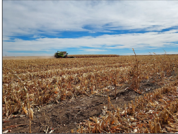
Image 12. Combine harvest of corn grain from tillage plots in northern Dallam County, 2022