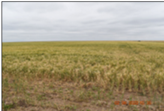
Image 4. Example wheat field monitored for late disease in Moore county, 2022.

Observations by Ken Obasa, Ph.D. and myself included 40 fields in Moore and Sherman followed by 35 fields in Dallam and Hartley counties, respectively. These efforts are key to tracking severity and spread of known diseases and to identify the emergence of new diseases such as in the field below (image 4). Our monitoring efforts provide additional insight and benefit grower management of a crop like the 541,125 harvested acres of Northwest Panhandle wheat in 2021 with an estimated value of 79.7 million dollars.