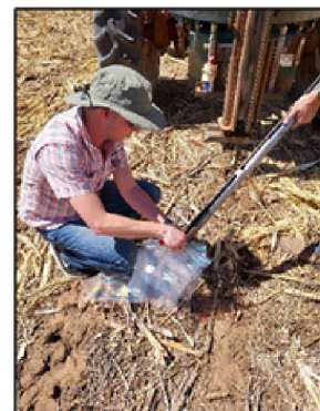
Images 6,7,8. Using a tractor mounted hydraulic probe to extract soil samples at profile depth for carbon analysis in northern Dallam county, 2022.