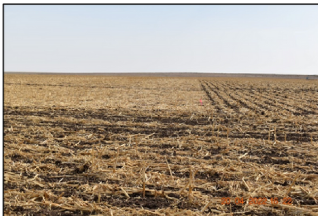
Image 10. Adjacent no-till (left side) and strip-till (right side) treatments in a pivot-irrigated field in Dallam county, 2022.