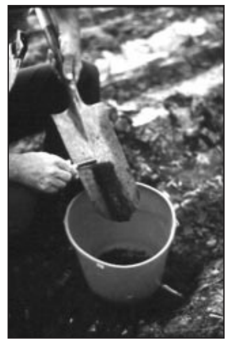
Figure 1. Soil sampling is the most important step in soil testing. Above is an example of a 1 x 1 x 6-inch core taken with a spade.

Table 3 illustrates the results from a typical soil test analysis. The numerical values are given in parts per million (ppm), which can be multiplied by 2 to obtain estimated pounds of nutrient per acre. Depending on the crop and yield goal (as requested on the soil test information sheet), a fertilizer recommendation for all major and most minor crops in Texas will be provided by the Texas AgriLife Extension Service Soil, Water and Forage Testing Laboratory. You may need to request recommendations from many commercial laboratories. The fertilizer recommendation can be used to determine commercial fertilizer needs, or used in conjunction with manure/wastewater analyses to determine proper land application rates.