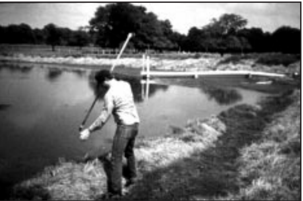
Figure 2. Lagoon effluent samples being collected with a bottle attached to a pole extension.

Clearly label each sample with an identification number. This number should correspond to the one listed on the sample identification sheet submitted with the sample to the laboratory. Place all